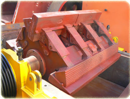
World-class craftsmanship and materials